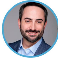
SEN. GUY PALUMBO*