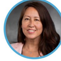
REP. DAVINA DUERR