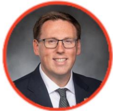
REP. KEVIN WATERS