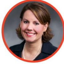
SEN. ANN RIVERS