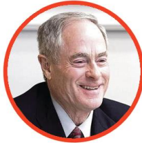
REP. TERRY NEALEY *