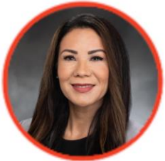
SEN. NIKKI TORRES