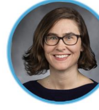
SEN. LIZ LOVELETT