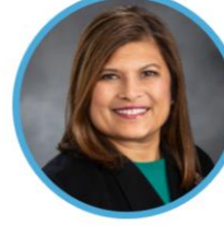
REP. VANDANA SLATTER