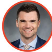
REP. SKYLER RUDE