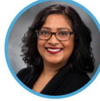
SEN. MONA DAS *