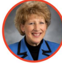
SEN. SHELLY SHORT