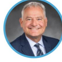
SEN. REUVEN CARLYLE *