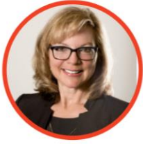
SEN. SHARON BROWN *