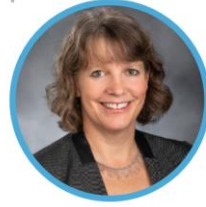
REP. BETH DOGLIO