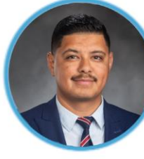
REP. JULIO CORTES