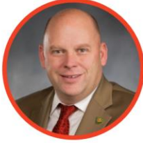
SEN. DREW MACEWEN