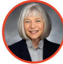
REP. NORMA SMITH *