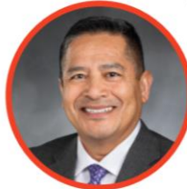
REP. ALEX YBARRA