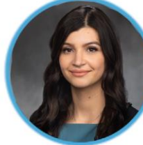
REP. SHARLETT MENA