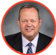
SEN. MATT BOEHNKE