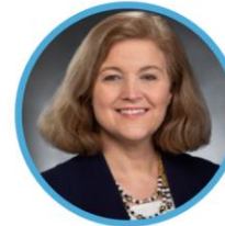
SEN. CHRISTINE ROLFES *