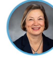
SEN. JUNE ROBINSON