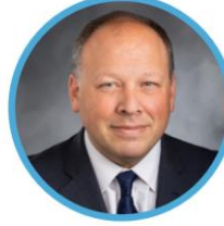
SEN. DAVID FROCKT *